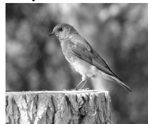
Western Bluebird, Sialia mexicana

For the past four years, my husband and I have watched Western Bluebirds raise families in a nestbox we put up near our kitchen window. Observing the wing waves and listening to the vocalizations of the male during courtship is great fun as is the nest-building by the female. We find it fascinating to monitor the box and track the hatchlings as they're growing. The show never ends from April to August, as the parents bring food all day long for their first and second broods. Later we enjoy watching the fledglings and their parents frolic in the birdbath and forage for insects and berries.