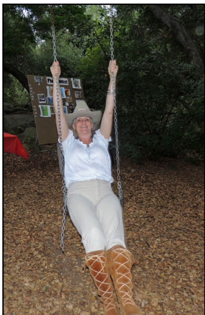
Ride 'em, Cowgirl!