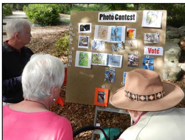
Which one is the best?