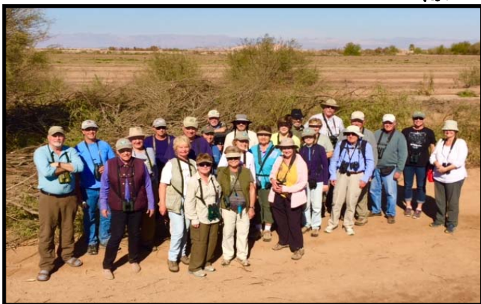
Let's hear it for the Salton Sea PAS-ers!!