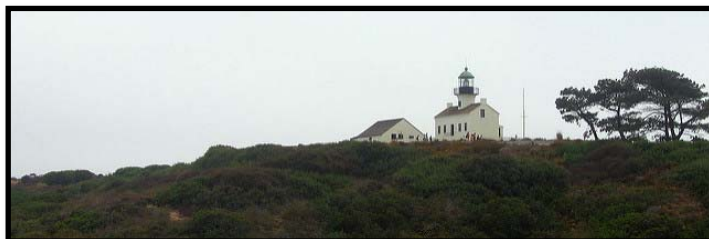
Cabrillo Lighthouse, San Diego