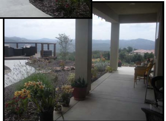
(just a peek at this year's picnic site)