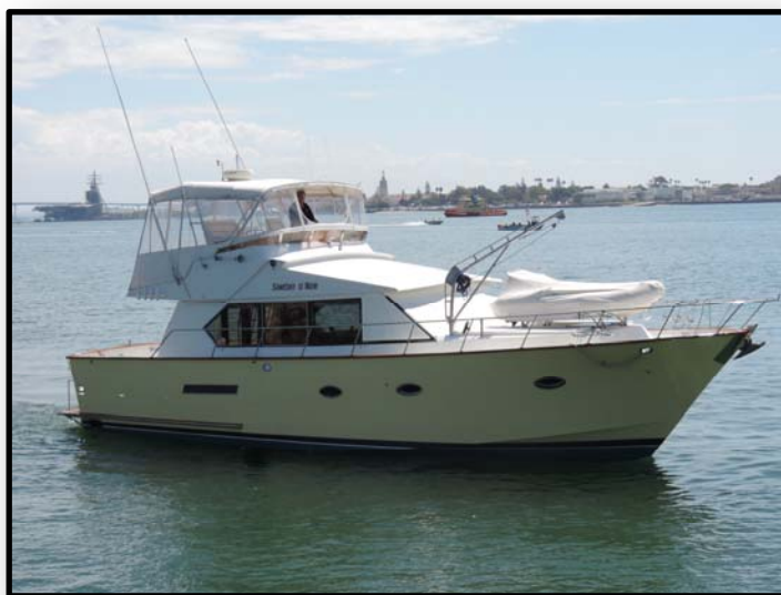
("Someday is Now")