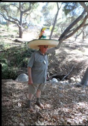
Now that's a winner!