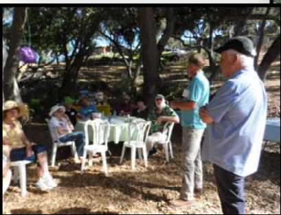
Looks good to me!