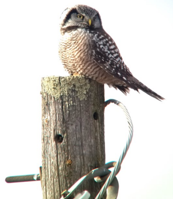
Northern Hawk Owl

The closest we got to seeing a Great Grey Owl at Sax Zim Bog.